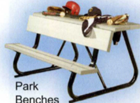
Park Benches and Athletic Benches

We design and manufacture them ourselves ... commercial quality products able to withstand years of use and exposure.