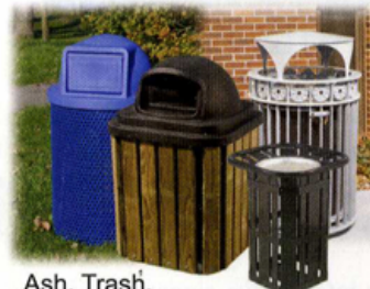
Ash, Trash, and Recycling Receptacles and Lids