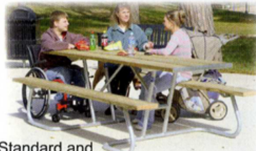
Standard and Accessible Park Tables, Kids Tables