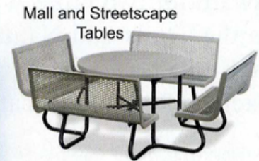
Mall and Streetscape Tables